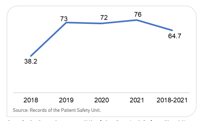
Graph 2. Completeness (%) of the Surgical Safety Checklists, per year. Fortaleza (state of Ceará), Brazil, 2018–2021.