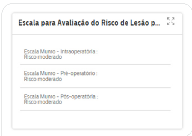
Figure 3. Munro scale results presented in the security alert (first quick view screen when opening the medical record); 2022