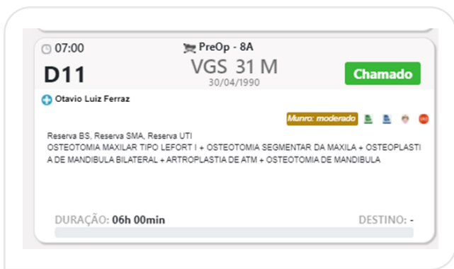
Figure 4. View of Munro scale result in the surgical map of an operating room (red for high risk and orange for moderate); 2022

The interventions proposed for the intraoperative period considering the risk previously identified were a matter of discussion, but the necessary care for the patient was reinforced, especially when it comes to minor surgical procedures and preventive measures in outpatients.