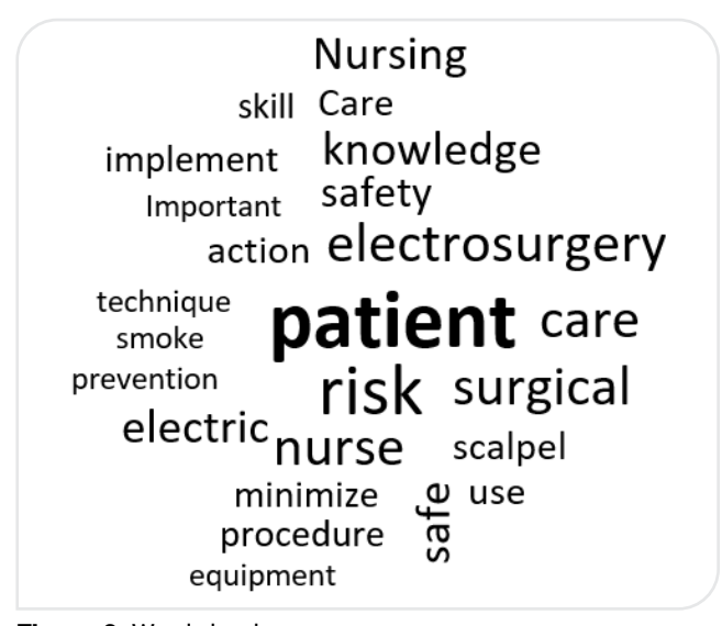
Figure 2. Word cloud.